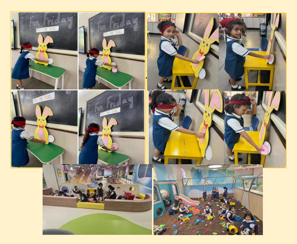
Higher KG trip to Kidzania